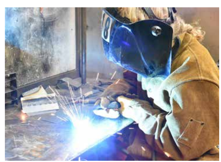
CTE Summer Camp Student in Welding

The demonstrated interest and growth of summer programing illustrates the continuing need and desire of high school students in Clackamas County to pursue college credit opportunities early in their educational journey. We hope to continue to help meet this need by further expanding our summer programs in 2020 and maintaining the low-cost structure which allows more students access to college credit.